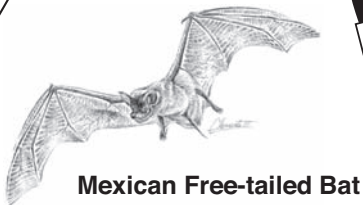
Mexican Free-tailed Bat

Stuart Bat Cave (Protected Habitat) Cave is closed year-round. Reservations required for scheduled bat flight viewings.