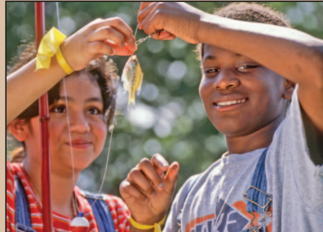
Fishing helps students discover pond ecology.

Call the learning center to schedule your school, scout or youth group for our exciting hands-on field study activities including wildlife discovery, pond ecology, fishing and alternative energy.