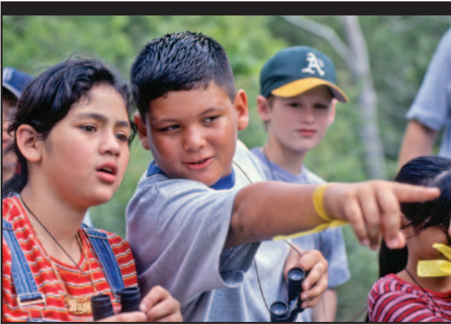
Urban youth discover the natural world at Sheldon Lake.

SHELDON LAKE STATE PARK AND ENVIRONMENTAL LEARNING CENTER IS A 3,000-ACRE HAVEN FOR WILDLIFE SURROUNDED BY THE HIGHWAYS, RAILROADS AND INDUSTRY OF HOUSTON. ITS PONDS AND WETLANDS TEEM WITH BIRDS, TURTLES, AQUATIC PLANTS AND ALLIGATORS. LAKE SHELDON PROVIDES DIVERSE WILDLIFE HABITAT WITH EXCELLENT BIRD-WATCHING, CANOEING AND FISHING OPPORTUNITIES. A FORMER FISH HATCHERY "GONE WILD" FORMS THE CORE OF A 40-ACRE NATURE LEARNING CENTER FEATURING ACCESSIBLE TRAILS, BRIDGES AND DECKS. THESE AMENITIES ENABLE SCHOOLS, YOUTH GROUPS AND CITY FOLKS TO ENJOY AN OUTDOOR EXPERIENCE CLOSE TO HOME.