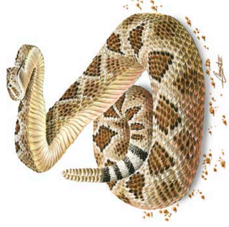
Western diamondback rattlesnake